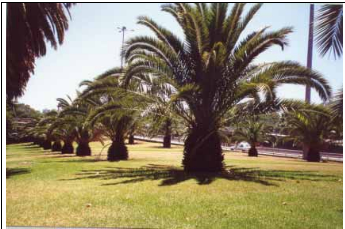
“Salad Bowl” – Macquarie precinct