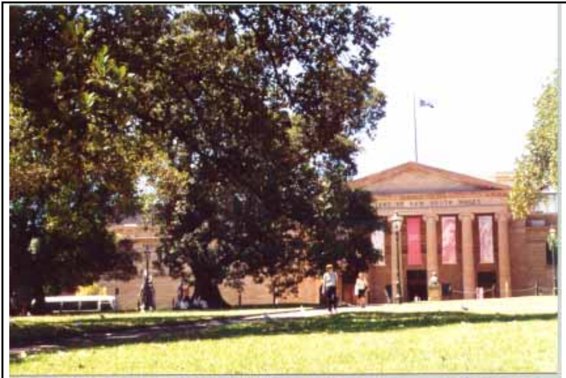
Art Gallery of NSW