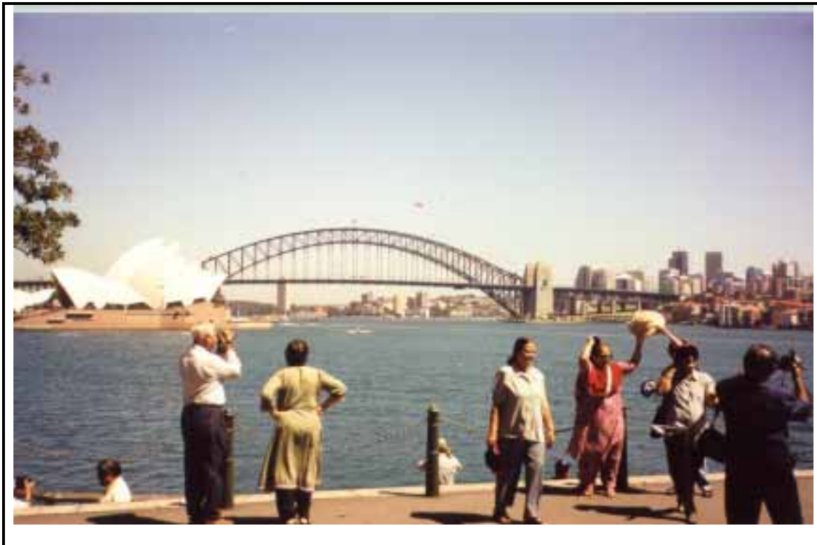
View from Mrs Macquarie's Point