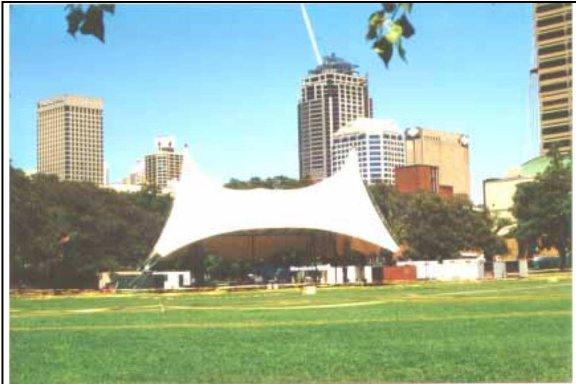
Sydney Festival events stage – Phillip precinct