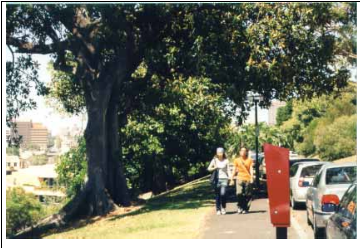
Mrs Macquarie’s Road, Woolloomooloo precinct