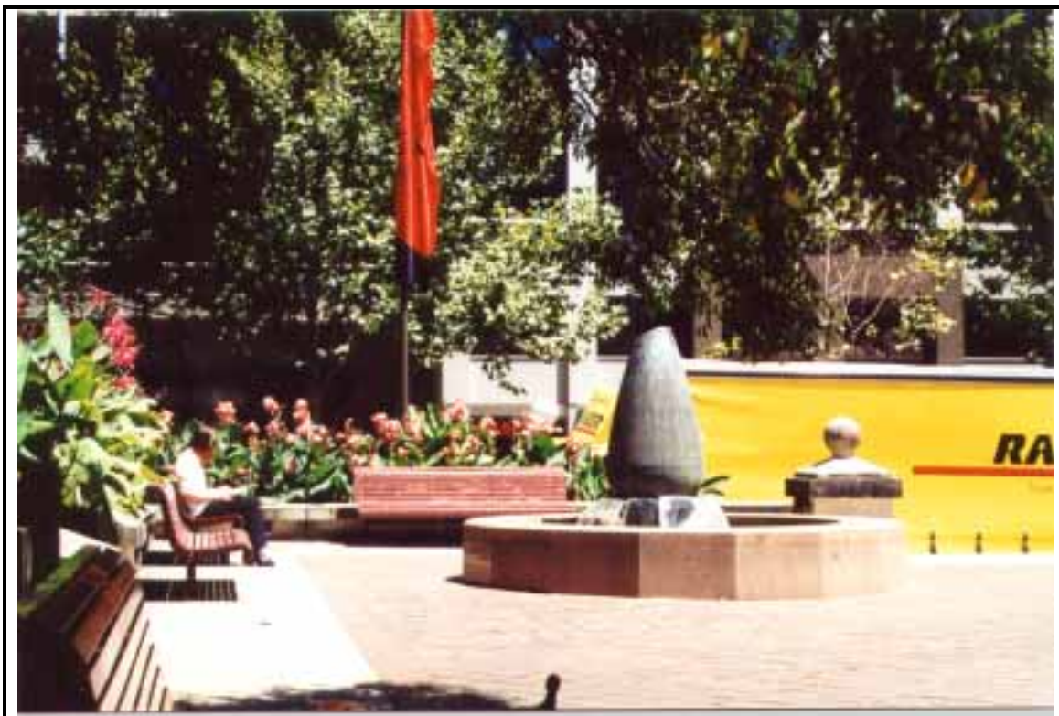
near Garden Palace kiosk