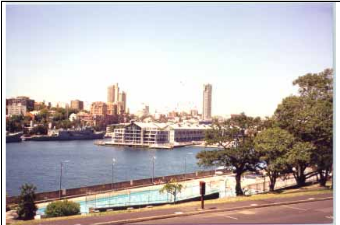
Andrew "Boy" Charlton pool and Woolloomooloo Bay

The strengths and weaknesses of the Domain, and opportunities for and threats to recreation, events, functions and tourism are outlined overleaf in Table 9.1 .