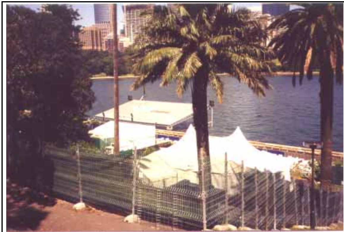
Open Air Cinema – Yurong precinct