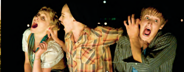
AS YOU LIKE IT.