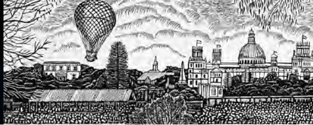
DETAIL, A HALF CENTURY OF CHARLES MOORE, REW HANKS