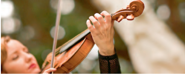
SKYE MACINTOSH, CONSERVATORIUM.