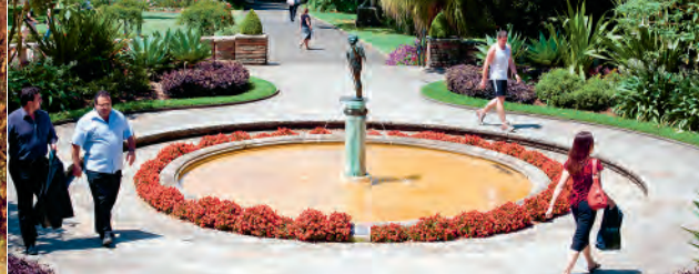
PALACE GARDENS TODAY.