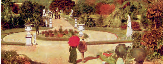
DETAIL, PALACE GARDENS c.1900. VINTAGE VIEW