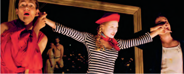
A MIDSUMMER NIGHT'S DREAM.