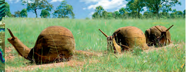
SNAILS, KEITH POLSEN.