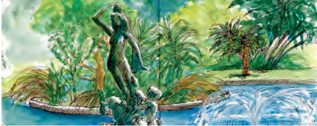
VENUS FOUNTAIN SKETCH, WENDY SHORTLAND