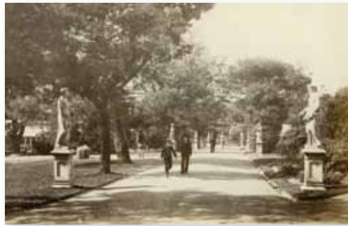
LEFT ~ Garden Palace c. 1880 RIGHT ~ Turn of the century — the Royal Botanic Garden

We are five years out from the Bicentenary of the Royal Botanic Garden in 2016. A point like this in history makes us consider our role and relevance in today's society and our vision for the future to address that role. We are setting the vision for the Gardens for the next 100 and 200 years to meet the expectations of the community looking forward.