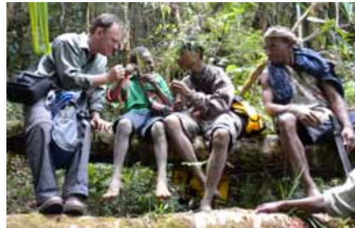
LEFT ~ Curtis Illustration