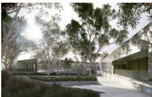
BELOW ~ PlantBank BVN Architecture Images

The flagship projects of the Botanic Gardens Bicentenary 2016 are imperatives in meeting the vision of the Trust to enrich each visitor experience, recreationally and educationally, and to better conserve our native flora.