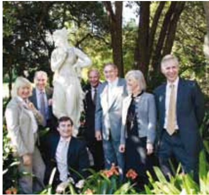
Benefactors and speakers with La Ballarina