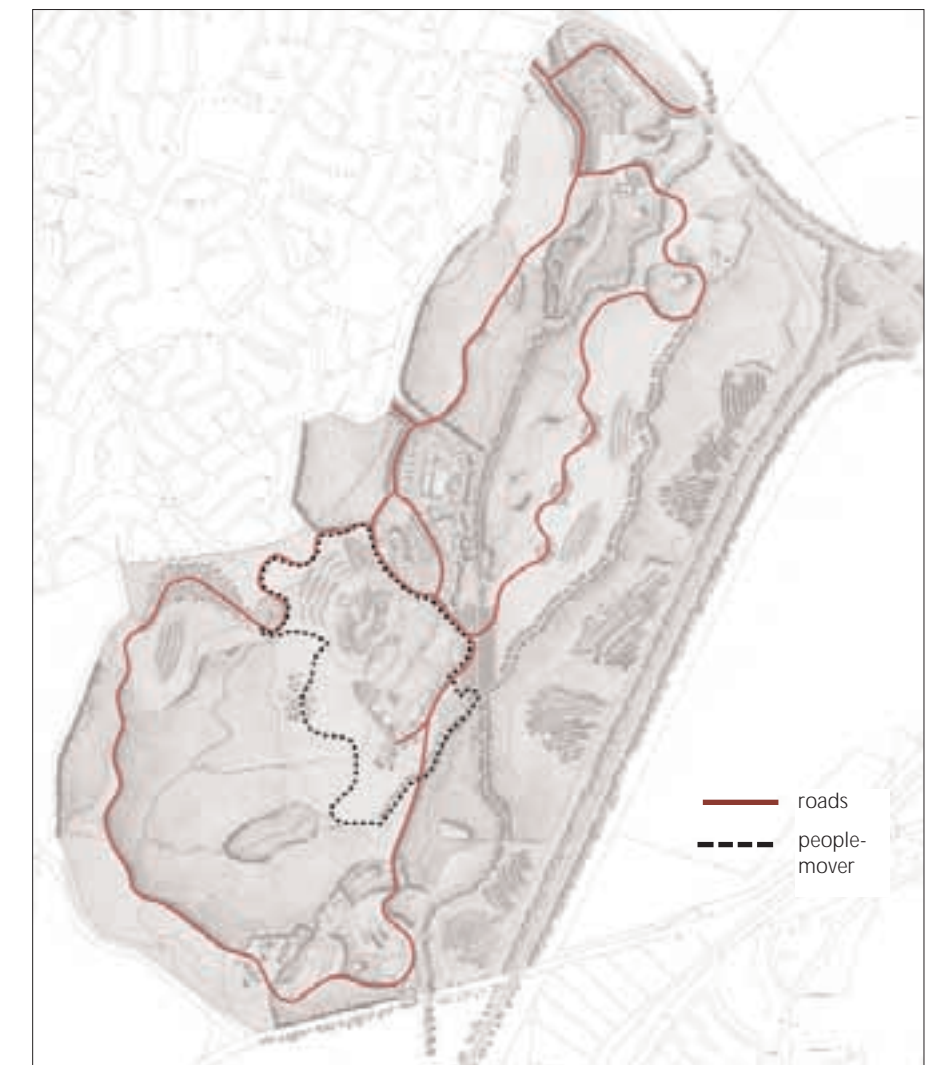
Figure 1 Vehicular and people-mover routes within the Garden