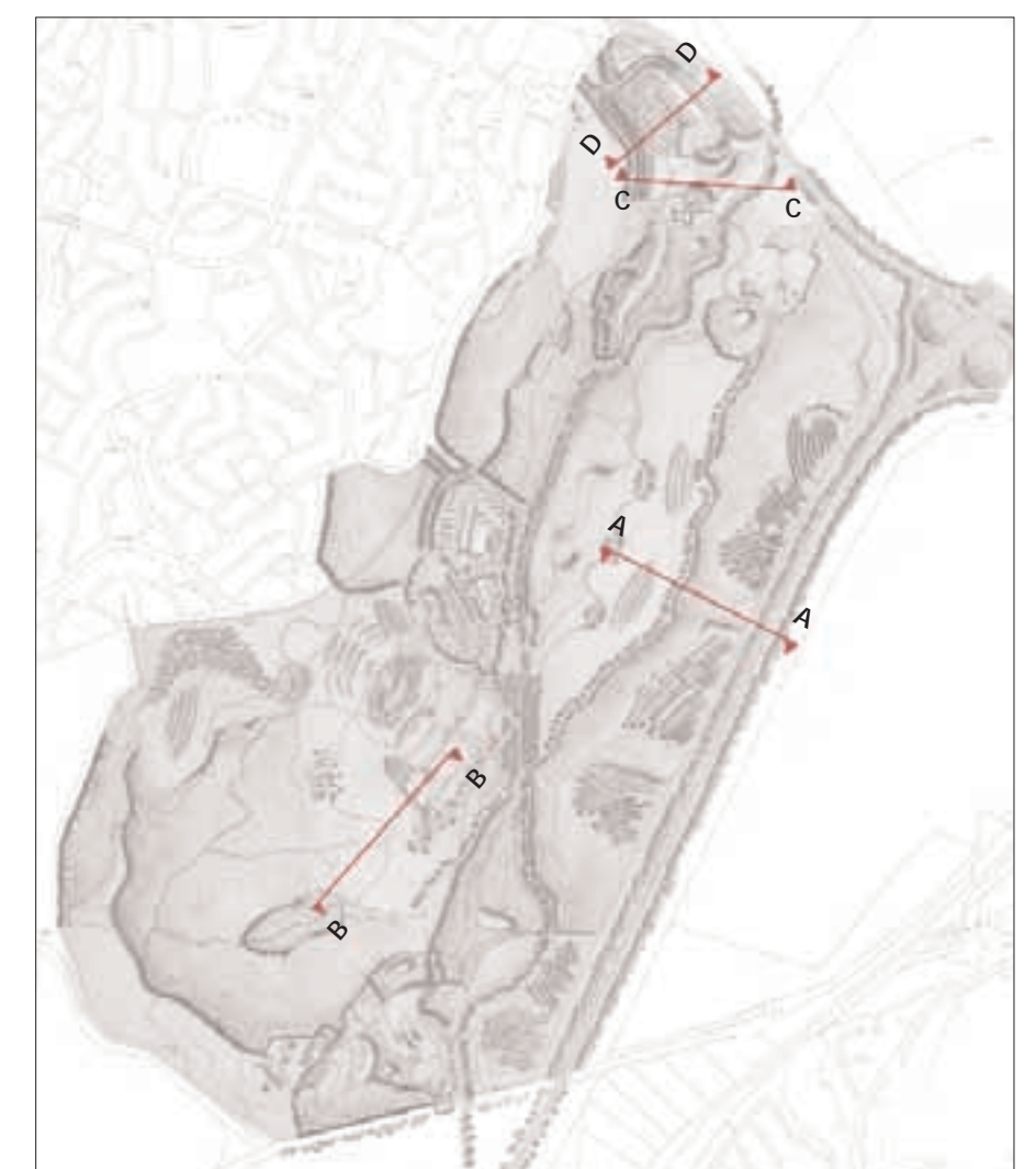
Figure 2 Key to the sections through site (over page)